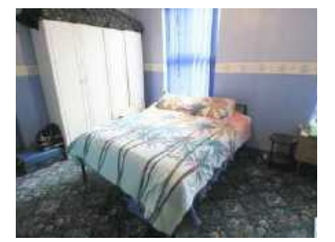
Bedroom 2 12' x 9'8(3.66m x 2.95m) Window to rear, built in cupboard, radiator.

Bedroom 1 14' x 11'(4.27m x 3.35m) Window to front, stairs to loft room, radiator.