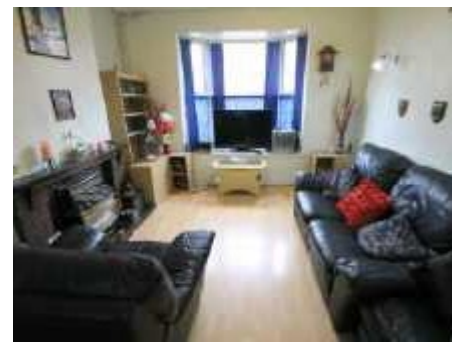
Dining Room 12'1 x 11'10(3.68m x 3.61m) Laminate wood flooring, radiator, two openings to kitchen.

Bay window to front, fire surround with gas fire inset, laminate wood flooring, radiator, opening to dining room.