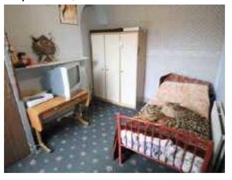
Bedroom 3 9' x 8'4(2.74m x 2.54m) Window to rear, radiator.