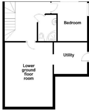
Lower Ground Floor Approx. 46.4 sq. metres (489.5 sq. feet)