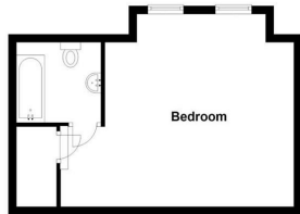
Second Floor Approx. 30.5 sq. metres (329.5 sq. feet)

These particulars, whilst believed to be accurate are set out as a general outline only for guidance and do not constitute any part of an offer or contract. Intending purchasers should not rely on them as statements of representation of fact, but must satisfy themselves by inspection or otherwise as to their accuracy. No person in this firm's employment has the authority to make or give any representation or warranty in respect of the property.