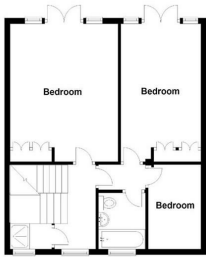
First Floor Approx. 55.2 sq. metres (594.2 sq. feet)