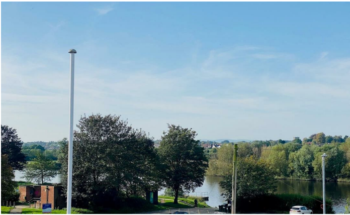
VIEW OF THE RIVER DEE FROM THE LIVING ROOM

The property has off-road parking positioned directly in front of the property with access to the double garage. There are paved steps on the right that rise alongside the property to an iron gate which provides access to the front door with a covered storm port and lighting. Continuing alongside the property across a slate chip pathway lined by heavily stocked and colourful beds and borders, this will bring you to the rear garden, which is laid to lawn with slight chip pathways and well-stocked, beds and borders with a secluded, circular paved seating area. From the rear garden through an archway is the side garden with an elevated, raised patio area enclosed by walling slate and pathways leading through beautifully presented and well stocked colourful gardens retaining a planter to plant shrubs and mature trees.