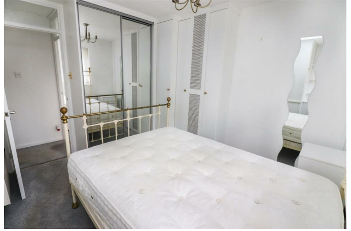
Bedroom Two 10'9" x 6'8" (3.30m x 2.05m)