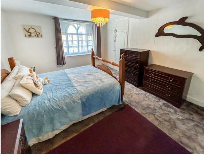
Another double bedroom with built in wardrobe, radiator and countryside views.