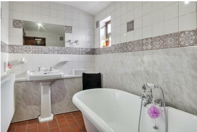
Comprising hand wash basin, bath, airing cupboard, radiator and views.