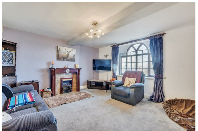
Featuring a fireplace with electric fire, countryside views and radiators.