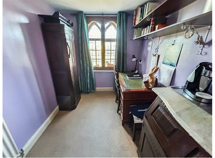
Good office space with distant views of the countryside and radiator.