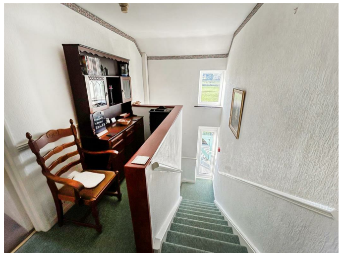
With loft access.