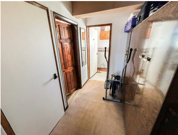
Airing cupboard, space for wardrobes and shelving for storage.