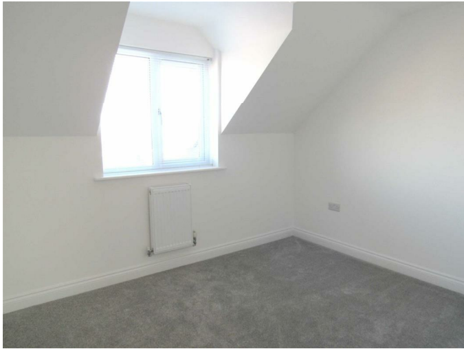
With window to the front and radiator