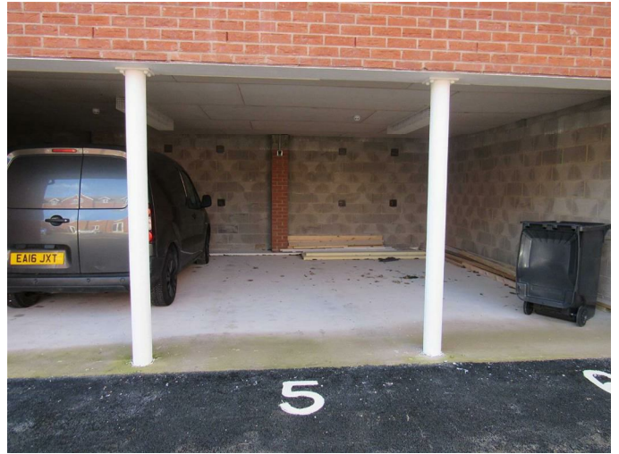
With allocated secure parking for one vehicle.