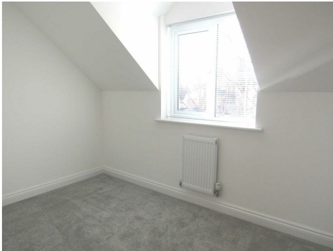
With window to the rear and radiator.