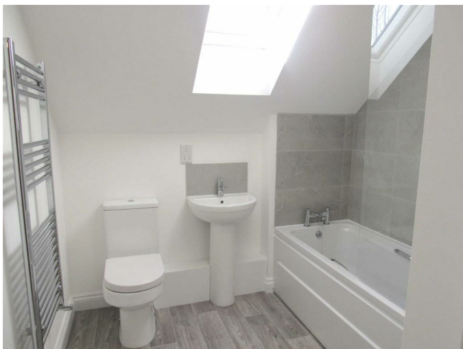
With brand new three piece suite in white comprising of panelled bath with shower attachment over, w/c and wash hand basin, part tiled walls, towel rail, Velux skylight and vinyl flooring.