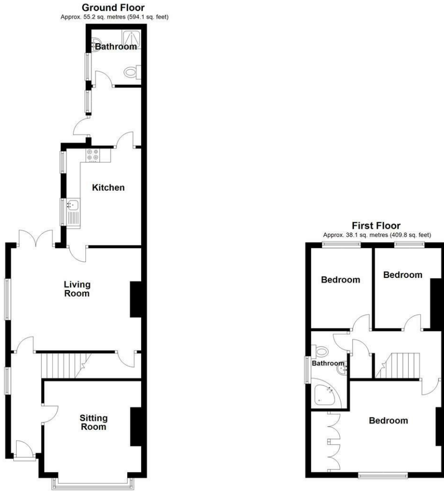
Total area: approx. 93.3 sq. metres (1003.9 sq. feet)