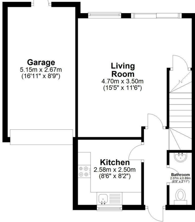
Ground Floor Approx. 47.3 sq. metres (509.4 sq. feet)