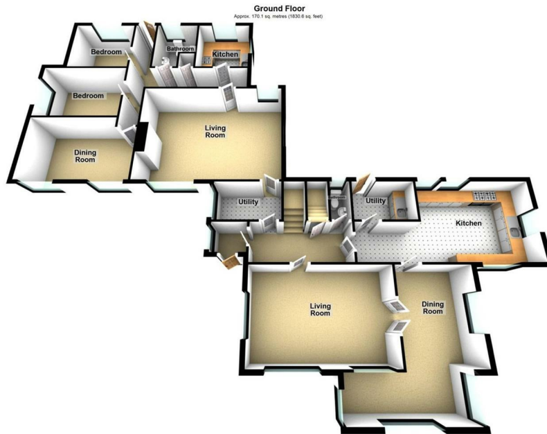
Total area: approx. 240.2 sq. metres (2585.8 sq. feet)