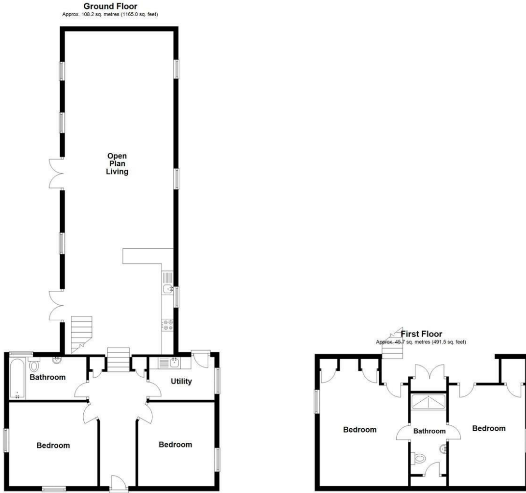
Total area: approx. 153.9 sq. metres (1656.5 sq. feet)