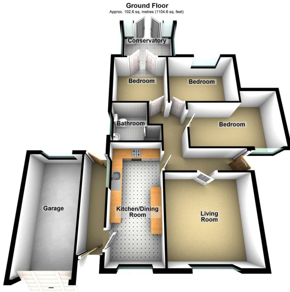
Total area: approx. 102.6 sq. metres (1104.6 sq. feet)

These particulars, whilst believed to be accurate are set out as a general outline only for guidance and do not constitute any part of an offer or contract. Intending purchasers should not rely on them as statements of representation of fact, but must satisfy themselves by inspection or otherwise as to their accuracy. No person in this firm's employment has the authority to make or give any representation or warranty in respect of the property.