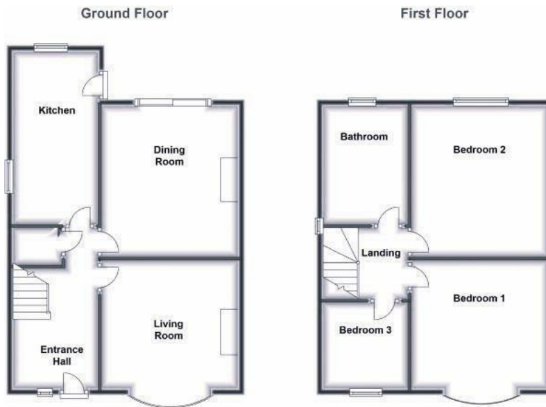
For illustration purposes only Plan produced using The Mobile Agent.

These particulars, whilst believed to be accurate are set out as a general outline only for guidance and do not constitute any part of an offer or contract. Intending purchasers should not rely on them as statements of representation of fact, but most satisfy themselves by inspection or otherwise as to their accuracy. No person in this firm's employment has the authority to make or give any representation or warranty in respect of the property.