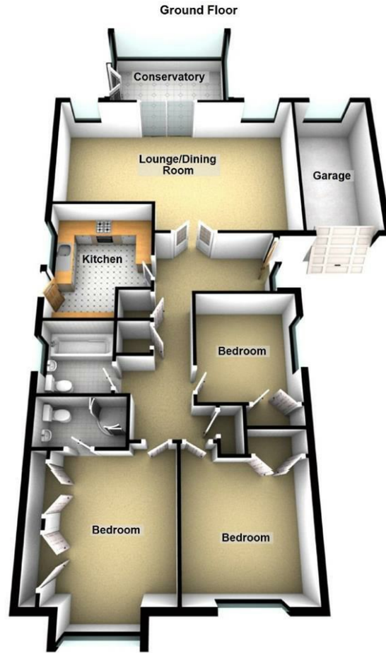
25 plas fynnon way, Oswestry