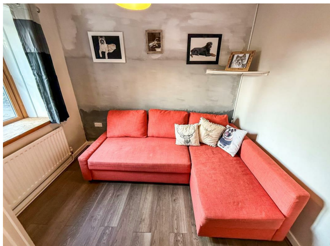
Bedroom Two 9'6" x 7'6" (2.90m x 2.30m)

The second bedroom has a window to the front with a deep oak window sill, wood flooring, built in cupboard and a radiator.