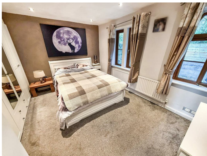
Bedroom One 13'5" x 9'6" (4.10m x 2.90m)

The good sized double bedroom has two windows to the rear overlooking the garden and woodland, spotlighting, radiator and ample space for wardrobes and storage.