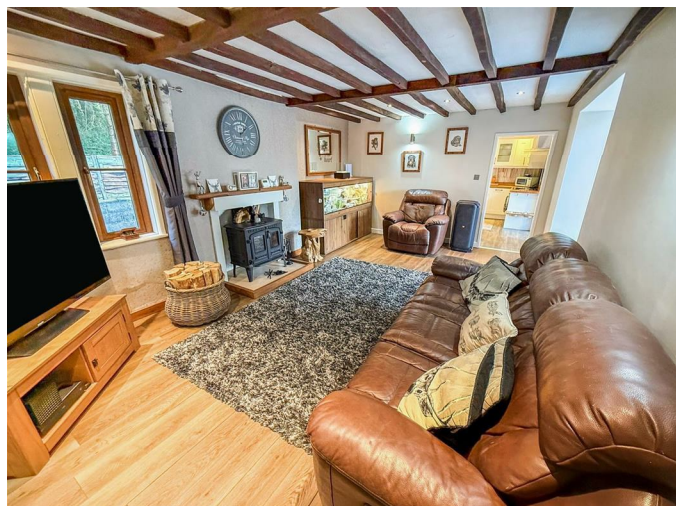
Lounge 19'4" x 12'1" (5.90m x 3.70m)

The spacious lounge is a great room to entertain as it opens out on the fantastic garden room to the front letting in lots of light and a feeling of space. Having a window to the rear, school style radiator, wood flooring, a lovely beamed ceiling, wall lighting, tv point and a focal log burning stove on a marble hearth with a surround and oak mantle over. The lounge also connects with the kitchen via an archway making it a real sociable space.