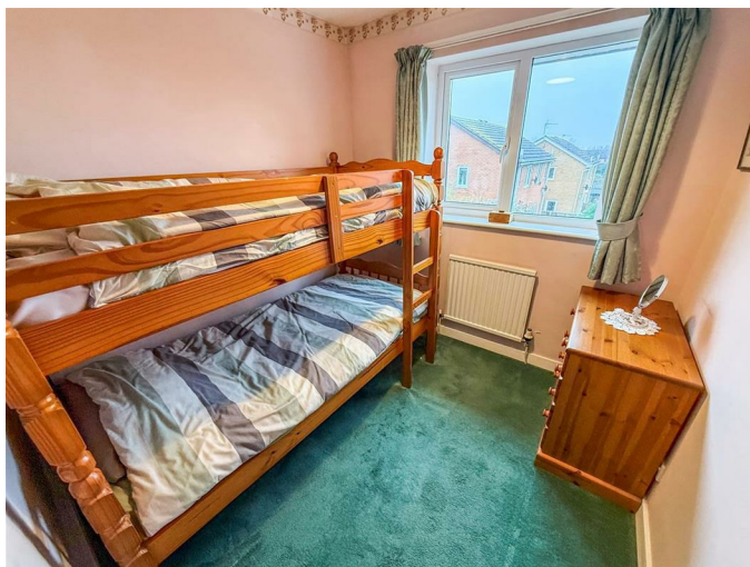
Bedroom Four 7'10" x 7'9" (2.40m x 2.38m)

The fourth bedroom has a radiator and a window overlooking the rear garden.