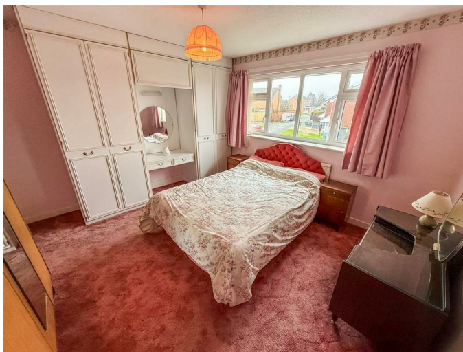
Bedroom One 12'9" x 12'2" (3.90m x 3.71m)

The spacious first double bedroom has a window to the front, radiator and a range of fitted wardrobes and dressing table.