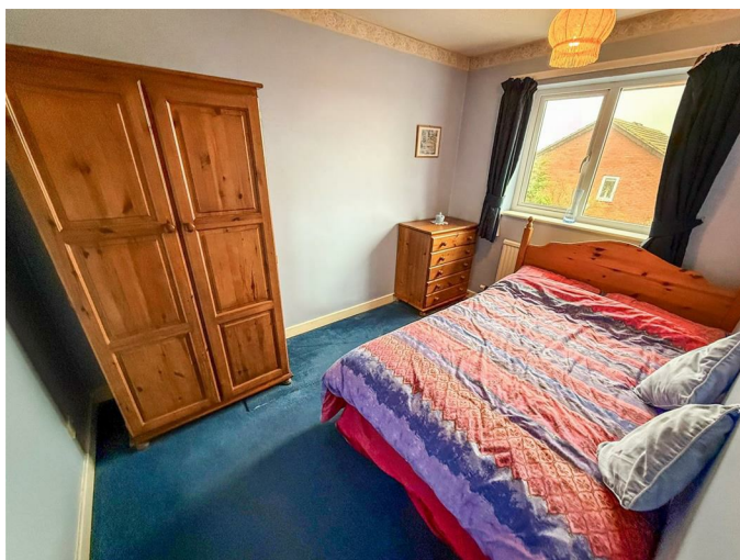
Bedroom Two 10'11" x 7'9" (3.34m x 2.38m)

The second double bedroom has a radiator and a window to the rear overlooking the garden.