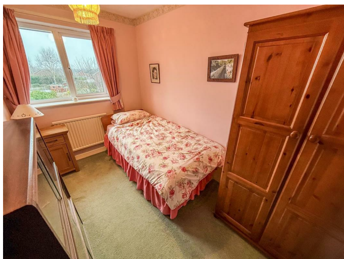
Bedroom Three 10'11" x 6'6" (3.33m x 2.00m)

The third bedroom has a radiator and a window to the rear overlooking the garden.