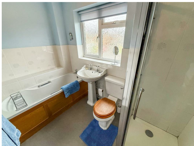
Family Bathroom 9'7" x 5'6" (2.93m x 1.69m)

The modern family bathroom has a window to the front, panelled bath, wash hand basin, low level w.c., shower cubicle with a mains powered shower, vinyl flooring, radiator, part tiled walls and a shaver point.