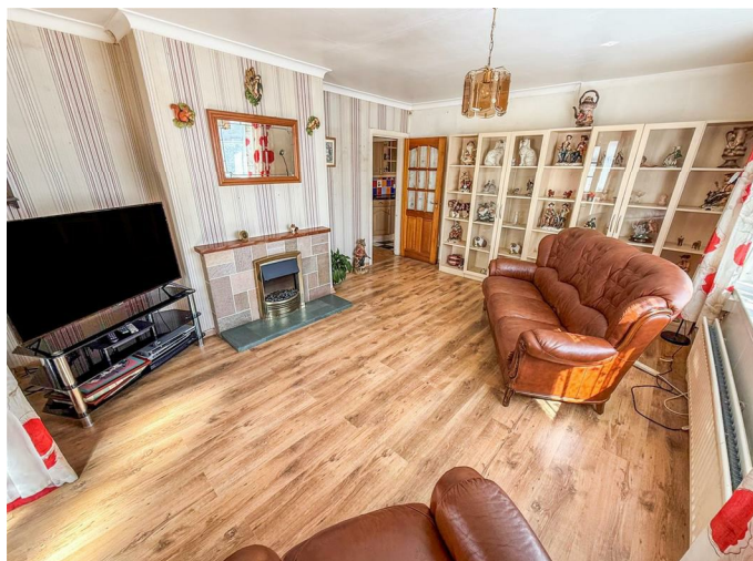
Lounge 12'11" x 15'10" (3.95 x 4.84m)

The spacious and bright lounge has a bay window to the front, a radiator, a stone fireplace with inset electric fire, wood flooring, a coved ceiling and a part glazed door which leads to the conservatory.