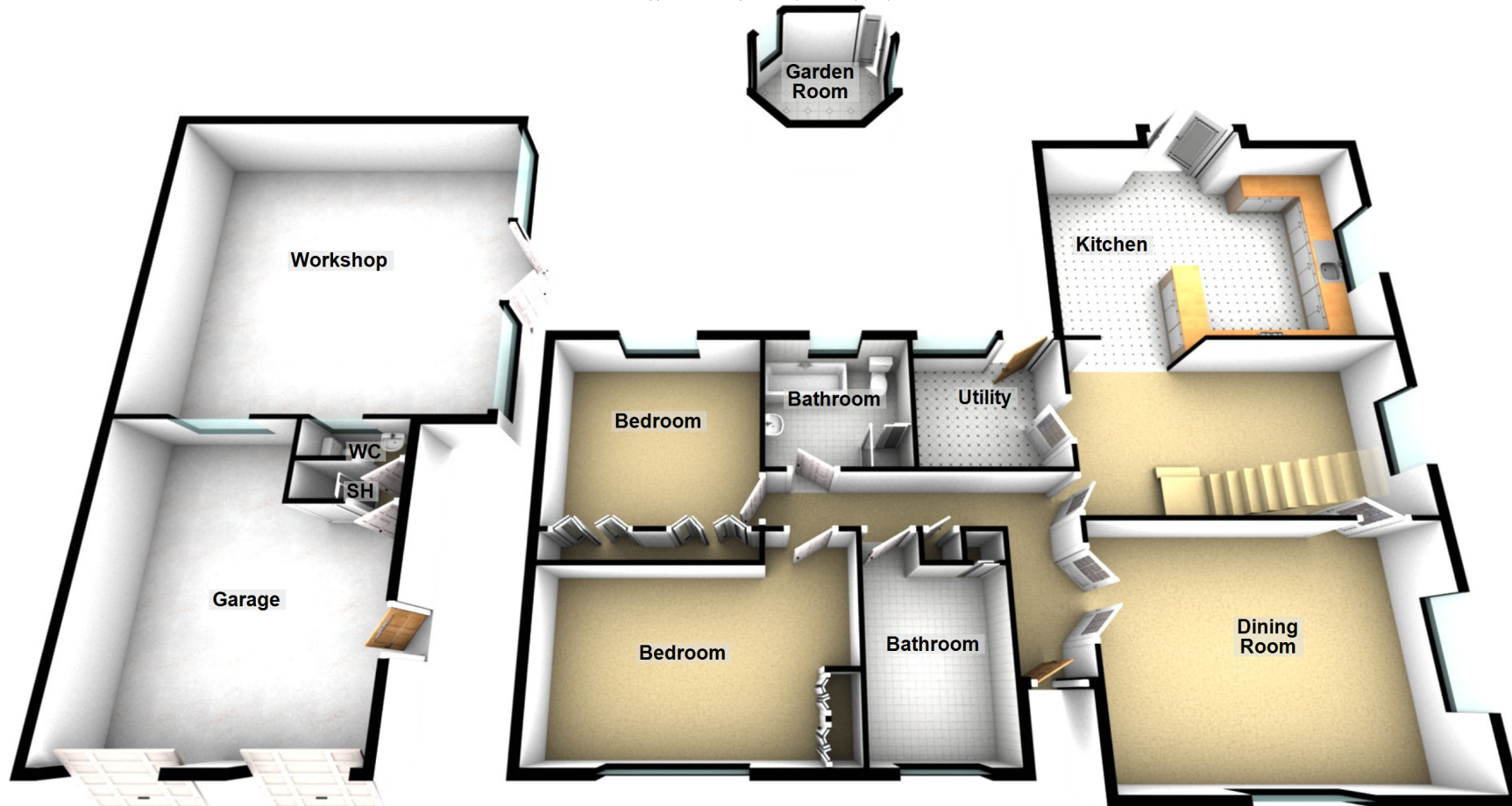
Ground Floor Approx. 234.6 sq. metres (2525.5 sq. feet)