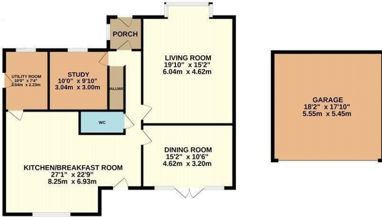
GROUND FLOOR 1383 sq.ft. (128.5 sq.m.) approx.