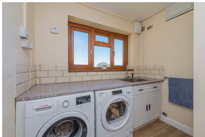
Utility Room 7'1" x 8'11" (2.18m x 2.72m )

The utility room has further base units with work surfaces over, plumbing for appliances, sink and drainer unit with mixer tap over and a vertical column radiator. Spotlights to the ceiling and wood flooring throughout. There is also an airing cupboard off housing the Worcester boiler.